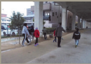
Play soccer game

In addition, Prophet Muhammad (Peace be upon him) said, "When a man dies, all of his deeds are terminated except for three types: an ongoing charity, implemented knowledge, and a virtuous child who prays and asks for forgiveness for his parents" (Narrated by